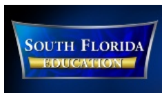
South Florida Education