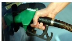
Gas price calculators